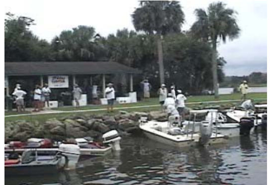
The boats lined up for a great day of fishing!