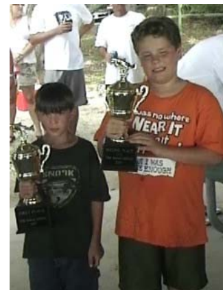
A couple of the day's young winners.