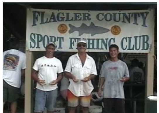
Some of the day's winners.